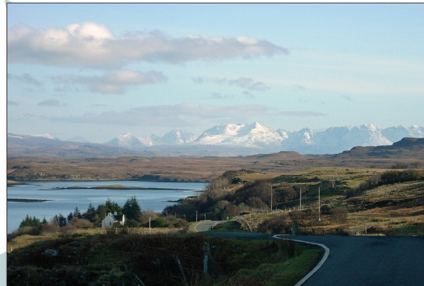
The snow-capped Cuillins from the single track road at Colbost. Snow usually dusts the tops in October and can linger on some of the higher north-facing summits until early June.