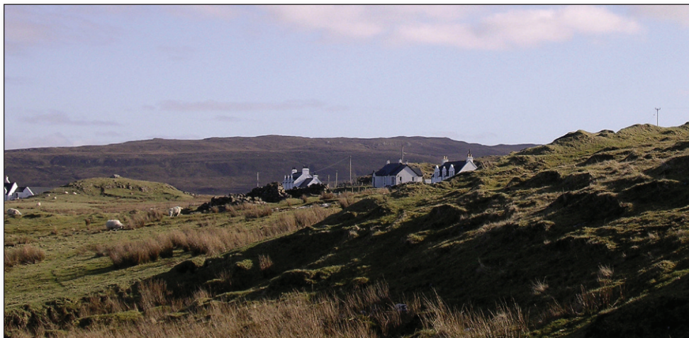
The scattered croft houses of Lower Milovaig overlook Loch Pooltiel and on to the Outer Hebrides.