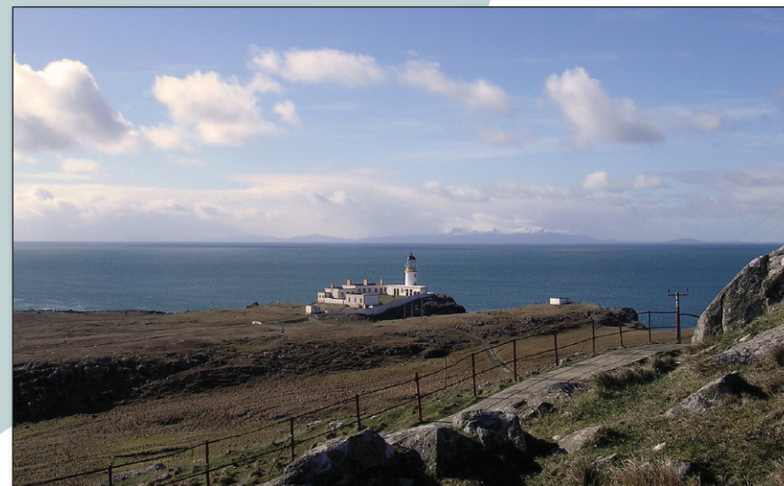
Neist Point forms part of the Glendale estate and shares in the common grazing rights for Watermish. The lighthouse buildings are privately owned.