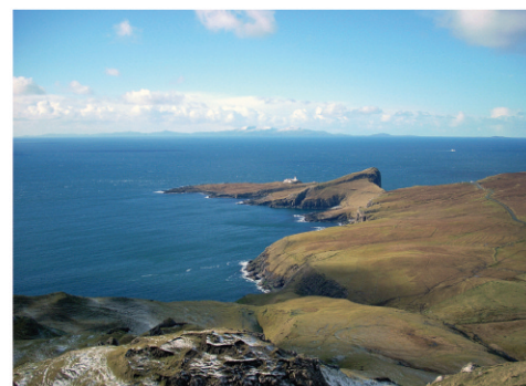
The route to Waterstein Head provides breathtaking views and none more than to Neist Point.